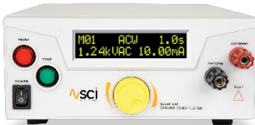
Figure 3.0: SCI Model 264

The SCI Model 264 is a 30 amp Ground Bond tester with multiple Memory Locations and Auto-offset capability (see Figure 3.0). Features like these make it easy on manufacturers of multiple products to test quickly and easily in a production environment. With multiple programmable Memory Locations, a test operator can set up, store, and recall parameters for different devices under test (DUT's). For example, say a manufacturer sells toaster ovens domestically in the U.S. and overseas into the European Union. With an SCI 264 the test operator can set Memory Location 1 to test at 60 Hz, 30 amps, and 60 seconds. Meanwhile, the operator can also set Memory Location 2 to test at 50 Hz, 25 amps, and 120 seconds. Recalling and toggling between Memory Locations is as easy as pressing a button, allowing the test engineer to quickly and efficiently test products to both countries' specifications.